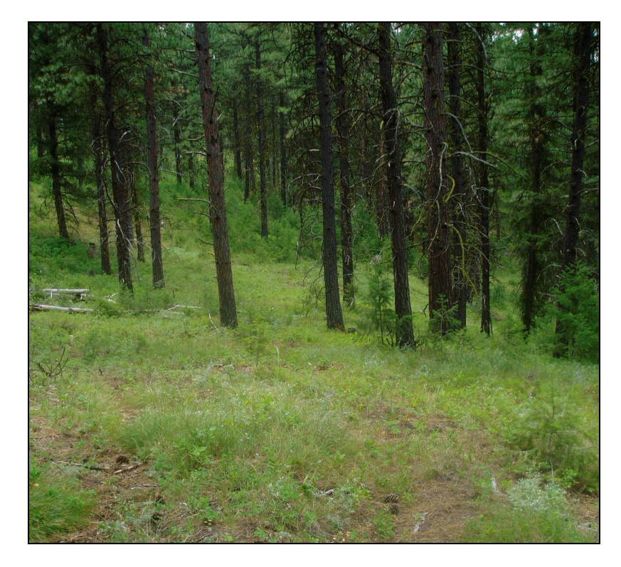
Figure 2. Mixed conifer forest with dense understory typical of survey area.