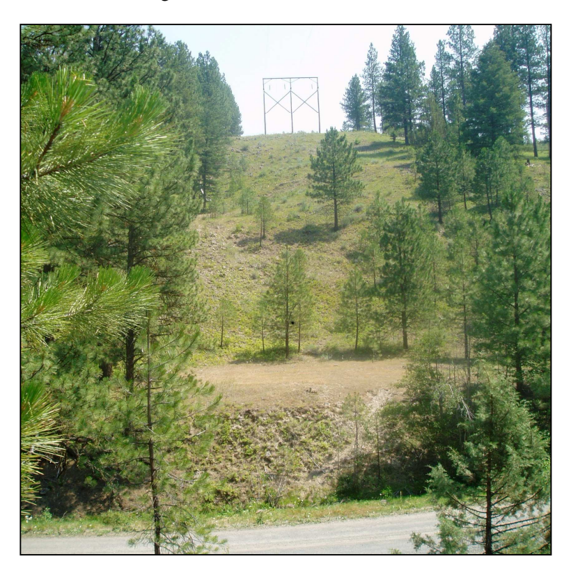
Figure 3. Powerline Corridor.