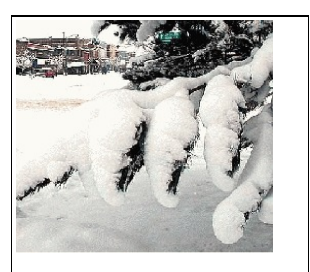
Baker City's Main Street was a winter wonderland Monday morning.